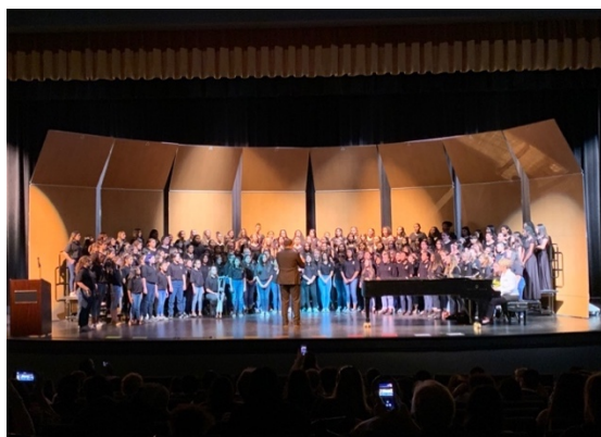
(AJB Choir Pictured)

AJ Briesemeister M.S. and Jim Barnes M.S. choirs both filled the stage at the PAC for their fall concerts on 10/17 and 10/18.