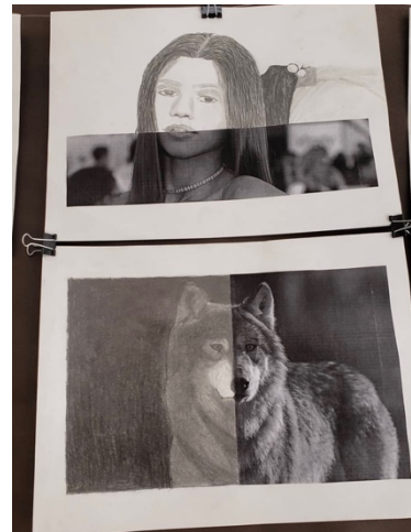
Art 1 Half photo / Half drawing examples from SHS