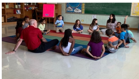
Jefferson ES Music Class