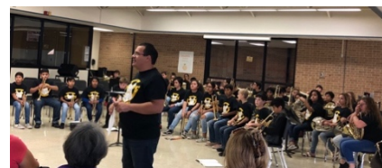
AJB Beginner Band