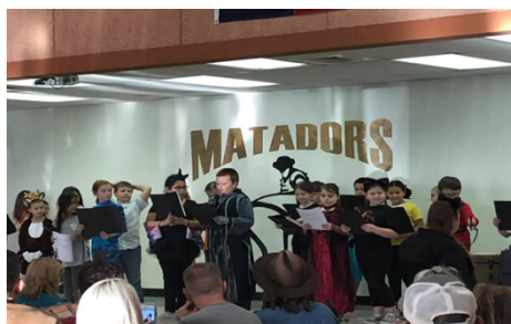
Vogel ES Music Performance