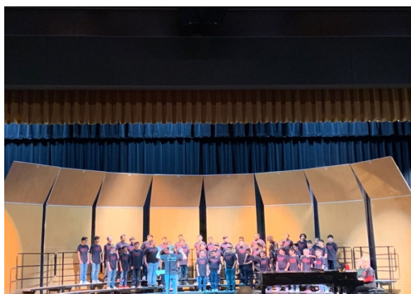
(JBMS Choir Pictured)