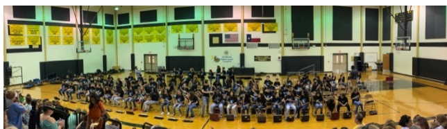
JBMS Beginner Band