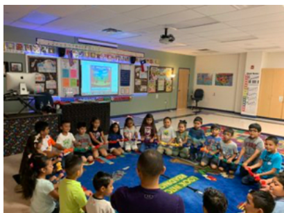
Rodriguez ES Music Class