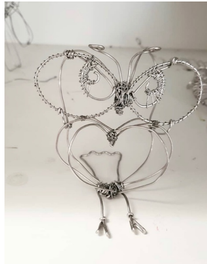
Art 2 Wire Sculpture from SHS