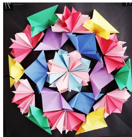
Art 2 Origami Sculpture from SHS