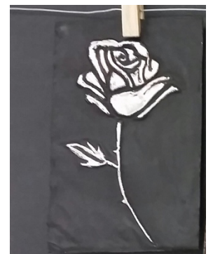
Copper tooling examples from Ms. Weem's Art class at SHS